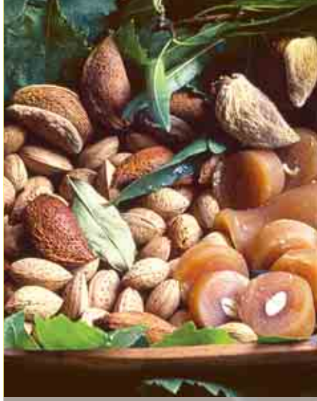
“Soudjoukos”, a traditional Cyprus sweet

The bustling main street of Pelendri can be quite testing for the driver, but it is only a couple of minutes before we are through and on our way to Potamitissa (3 km), and, a little further on, Dymes village. Though these hamlets do have some permanent residents, many houses are weekend places for city dwellers. Those who do live here have some lovely homes, with shaded courtyards.