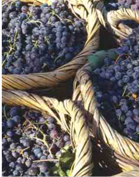
"Ofthalmo", one of the grape varieties here

At an altitude of 1 100 m Agros is the heart of the Pitsilia area. It is a large place, and a tourist centre for locals and foreigners alike, with good accommodation, and related services. Local Industries include rose and flower waters, bottled water, wine, flowers, honey and preserves.