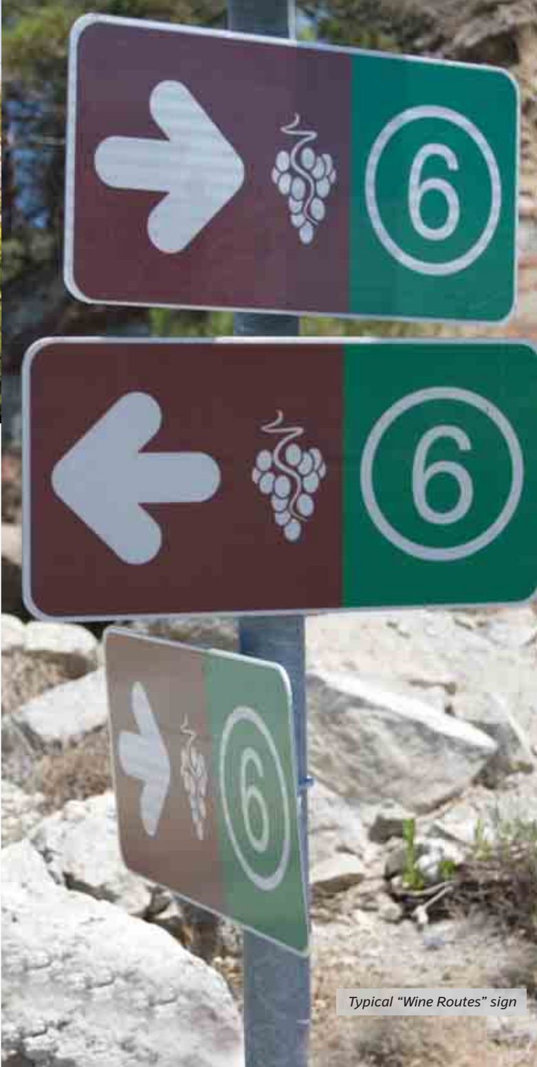
Typical "Wine Routes" sign