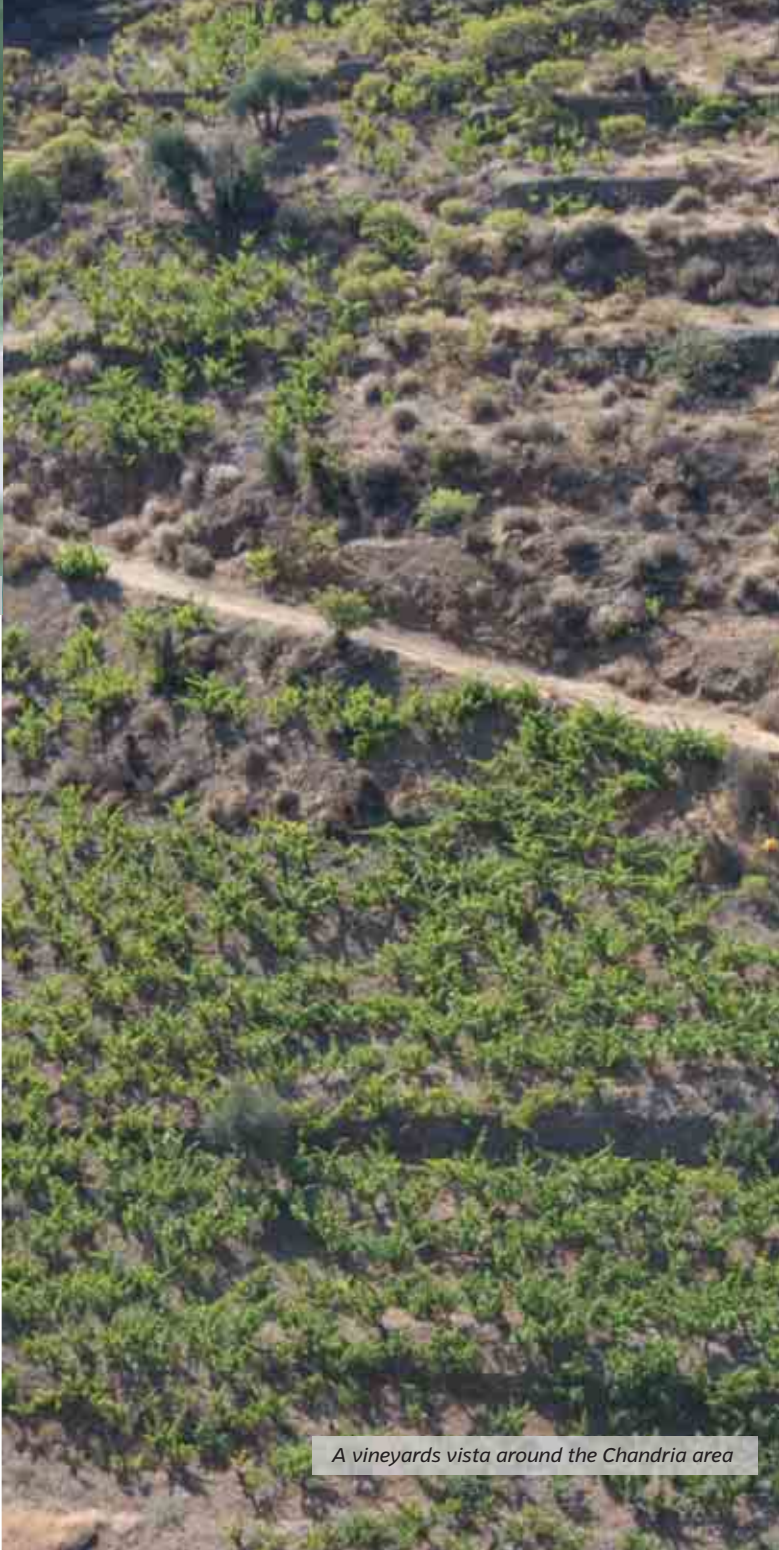
A vineyards vista around the Chandria area