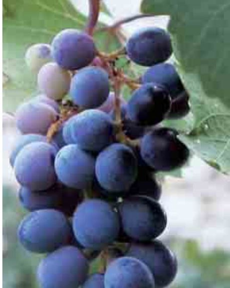
"Mavro", a common grape variety of the area

Plenty goes on in Pitsilia villages, quite a lot of it to do with food and wine. The area is surrounded by four forests: Troodos forest in the west, Machairas forest in east, the Adelfoi Forest in the north, and Lemesos forest to the south. It is dominated by the peak of Madari (1,672 m). Generally, there is ample rainfall here.