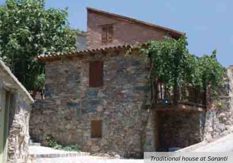
Traditional house at Saranti