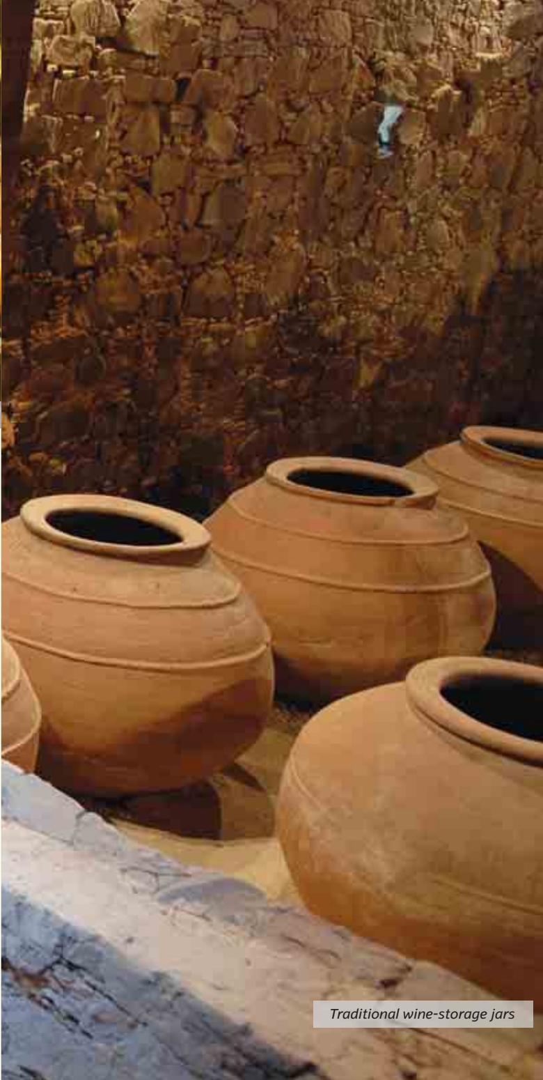
Traditional wine-storage jars