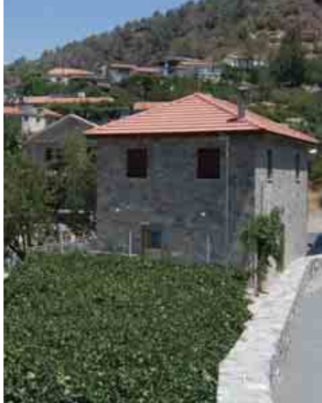
A house with a vineyard in Potamitissa