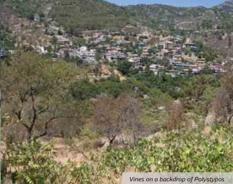
Vines on a backdrop of Polystypos