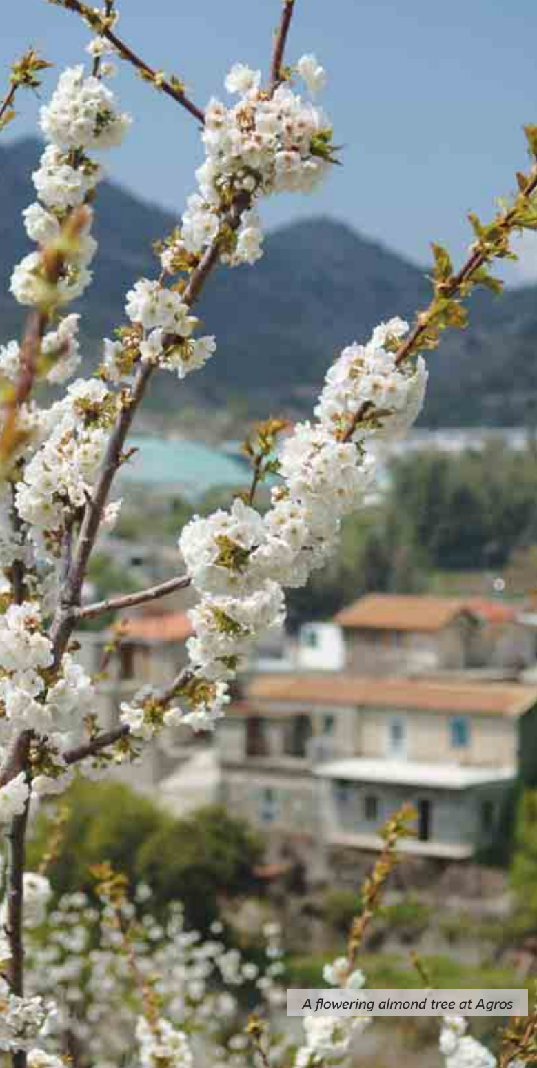
A flowering almond tree at Agros